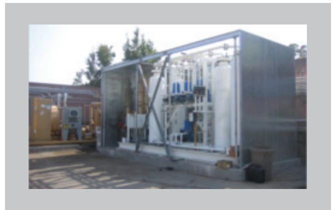
XEBEC'S compact M-3100, fast-cycle PSA system was the perfect solution for PXP at the Los Angeles Basin in California